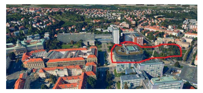
Figure 2: Locality of measurement in CTU in Prague campus - red contour.